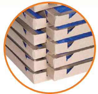
Notched Frame Design