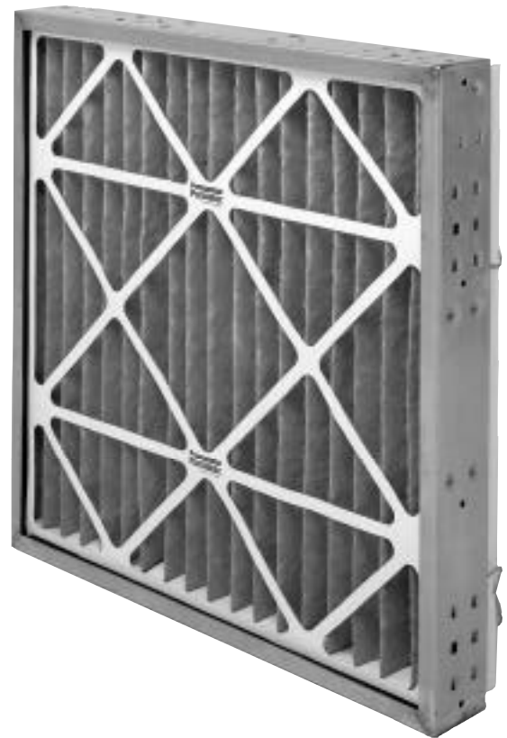
PURO Frame ASHRAE Holding Frame

HFFC-23: Shown above is a 1" filter alone in the PURO Seal frame.