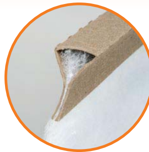
Pinch Frame Design