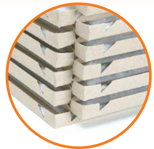
Notched Frame Design