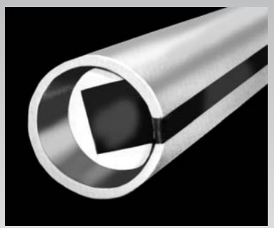
Type CR Core (to fit Carrier Corporation Series 31NA Roll Filter). Core is formed from a 2-7/16" fiberboard tube. The tube contains a metal cup secured in each end and recessed to a depth of 1-1/2". The cup is stamped to form a 1-1/2" square opening.