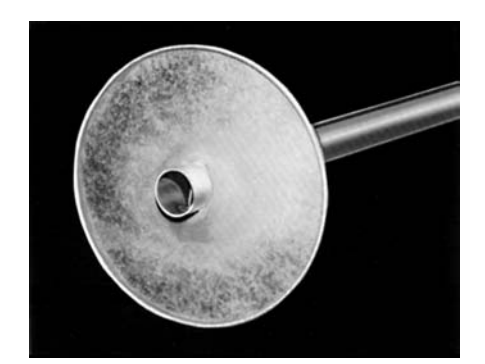
Type B Core (to fit BLC Industries Automatic Roll Machine). Core is constructed from 1-1/2" diameter: EMT conduit, with 11" diameter end plates recessed in approximately 1-3/8" from end of core.