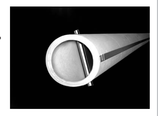
Type T Core (to fit Trane Company Roll Filter). Core is formed from 2-7/16" I.D. fiberboard tube. The tube contains a metal cup secured in each end recessed to a depth of 1-1/2" square.