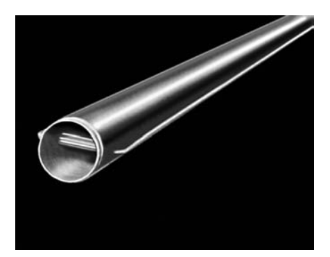
Type CB Core (to fit Cambridge Autoroll). Core is 3/4" welded steel tube. No metal discs are used. (if desired, please specify).