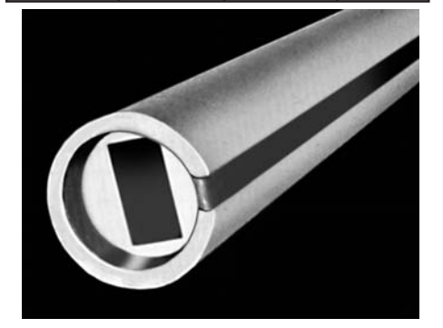
Type AM Core (to fit Airmaze Roll-A-Maze). Core is formed from fiberboard tube with 1-7/8" I.D. tube has recessed cups secured in each end with adepth of 5/8". Cup is stamped to form a 1-1/2" x 3/4" rectangular slot.